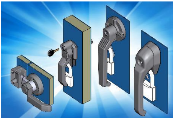
Specialist handles for thick doors from EMKA