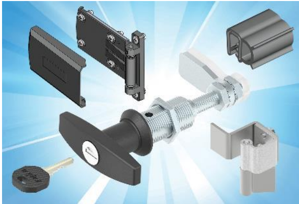
Enclosure hardware from EMKA for Air Conditioning Systems

The new EMKA HVAC Brochure – free from EMKA UK – also contains details of a variable locking L handle, pull handle, surface mounted 10mm compression locks, 2D hinge, 3D hinge, 180° screw-on hinge and a range of sealing profiles.