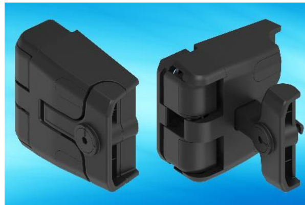
EMKA Compression locking hinge for HVAC installations